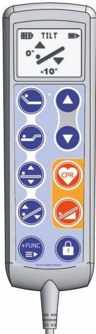
10 Key Operator Handset