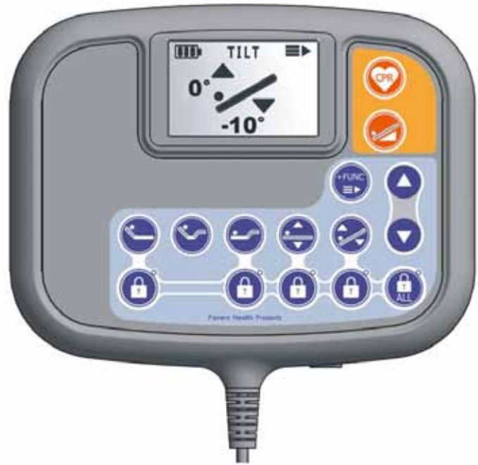
Operator Control Panel